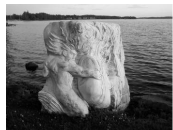
Carved granite figures along the lake shore walk in Burlington, VT.