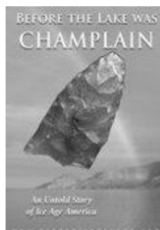
Before the lake was Champlain Documentary Film